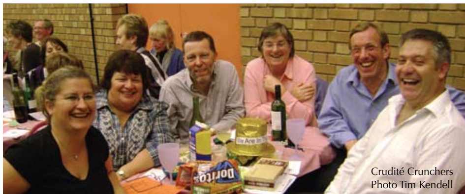
Crudit  Crunchers