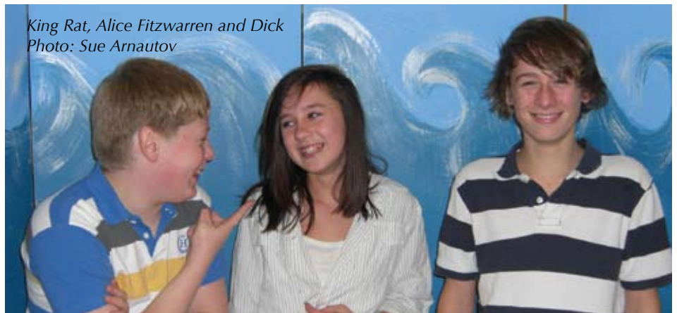
King Rat, Alice Fitzwarren and Dick